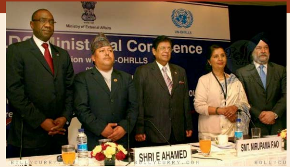
India welcomed LDC delegations for a pre-conference event on ‘Harnessing the Positive Contribution of South-South Cooperation for Development of Least Developed Countries’ in the run up to the Fourth UN Conference on the Least Developed Countries in Istanbul. Cheick Sidi Diarra (extreme left) noted the great potential of South-South cooperation as a “force multiplier” in LDC development.

O n February 18-19, 2011, India welcomed LDC delegations for a pre-conference event on “Harnessing the Positive Contribution of South-South Cooperation for Development of Least Developed Countries” in the run up to the Fourth UN Conference on the Least Developed Countries (LDC-IV) in Istanbul. Hosted by India’s External Affairs Minister and Foreign Secretary, the event enjoyed high-level attendance by several ministers and representatives of the LDCs, the Turkish Minister of Foreign Affairs H.E. Ahmet Davutoğlu, Secretary-General of LDC-IV Cheick Sidi Diarra, and observers from several development partner countries and UN agencies.