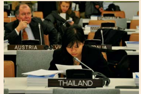
The Intergovernmental Preparatory Committee for the Fourth United Nations Conference on the Least Developed Countries held its first session at United Nations Headquarters in New York earlier this year.

The representative of Turkey briefed the Committee on practical arrangements and