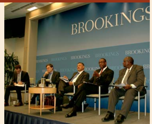
Last month the Africa Growth Initiative at Brookings, InterAction and the Center of Concern co-organized a discussion on U.S. and global policy on the Least Developed Countries, with a focus on LDCs in Africa.