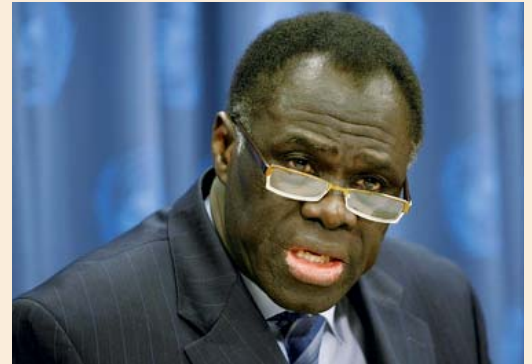
Ambassador Michel KAFANDO, Permanent Representative of Burkina Faso to the United Nations